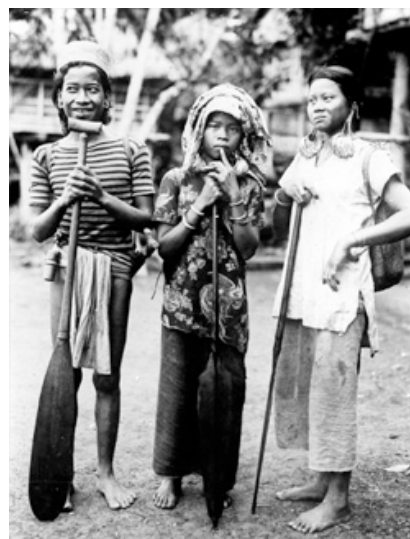
Three young girls in Borneo in 1925. Tropenmuseum.