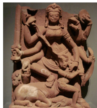
Indian sculpture from the 9th century. Los Angeles County Museum of Art.