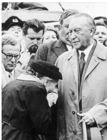
Konrad Adenauer and prisoner-of-war mother. Bonn, 1955.