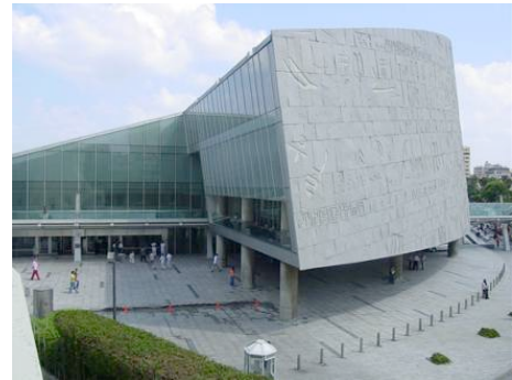
Library of Alexandria, Egypt

Wikimedia and cultural institutions in Canada share a common goal: access to the broadest possible educational and cultural resources. Many partnerships have been concluded between Wikimedia and museums, libraries and archives around the world (see below), these partnerships have demonstrated the significant contribution that cultural institutions may bring to Wikimedia projects, thanks to the richness and the variety of their resources. These partnerships have also been beneficial for cultural institutions involved. More visibility has brought more attendance. They were made possible by agreements with the relevant libraries and archives to make part of their resources available under a free licence (see below).