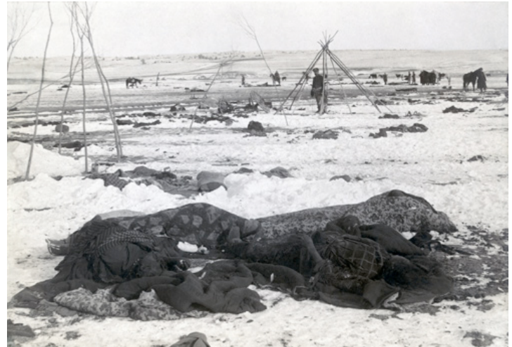
Albumen print of Camp Big Foot after the Battle of Wounded Knee (South Dakota, December 29, 1890).