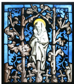
Peter von Andlau, Mater Dolorosa , 1480. The Metropolitan Museum of Art.