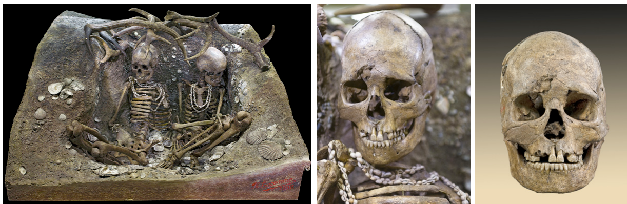
Théviac Grave - Museum of Toulouse, France.