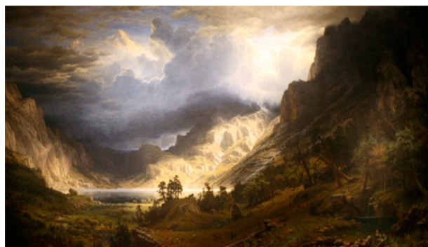
Albert Bierstadt, A Storm in the Rocky Mountains , 1866. Brooklyn Museum.